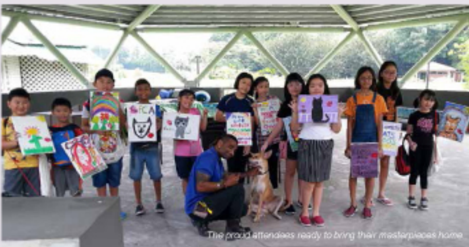
The proud attendees ready to bring their masterpieces home

I n view of the popularity of Aniversity from 2016, the Society for the Prevention of Cruelty to Animals (SPCA), Pet Lovers Centre (PLC) and Loyal.D came together once again on 6 December 2017 to conduct the programme to educate more children on animal welfare and responsible pet ownership.